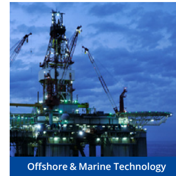
Offshore & Marine Technology