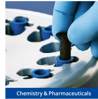
Chemistry & Pharmaceuticals